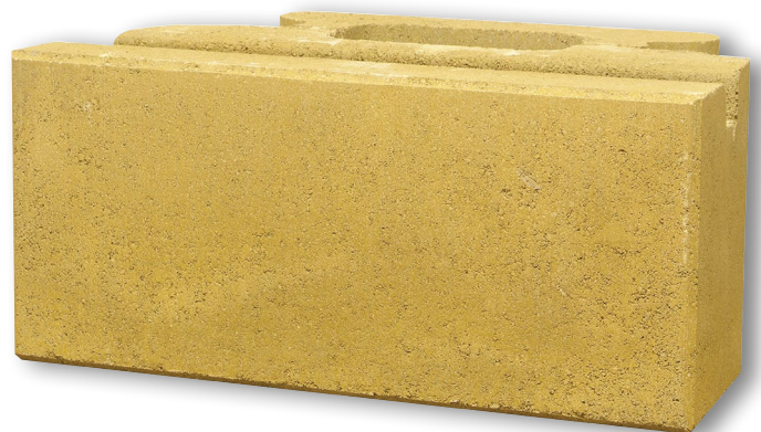
Near vertical attractive hard faced finish.

The System comprises of TensarTech® TW3 Smooth facing blocks, Tensar uniaxial geogrids, Tensar polymer connectors can when requested include an indemnified design that includes construction drawings and construction advice on-site via our UK civil engineering team. Although Tensar does not offer installation services we can supply a list of installers who work countrywide on Tensar projects.