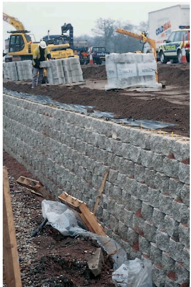
TensarTech™ TW3 blocks are delivered on pallets to the point of installation.