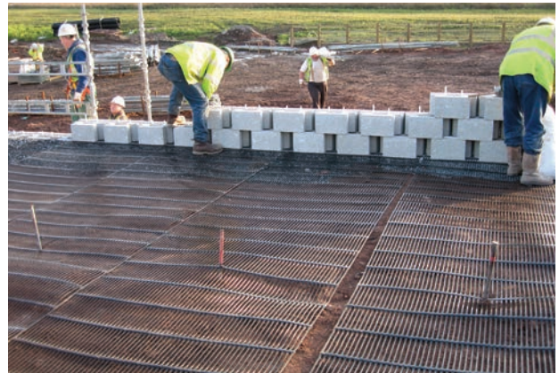
The TensarTech™ TW3 Wall System can be built without cranes or propping.