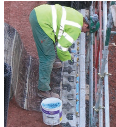
A feature common to all TensorTech™ Wall Systems is the high efficiency connection between geogrid and facing unit, which is quick and easy to install.