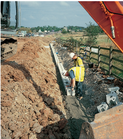
TensorTech™ TW3 concrete blocks are dry laid, without mortar.

The high pH associated with concrete blocks does not affect the durability and functionality of HDPE geogrid reinforcement during the life of the structure.