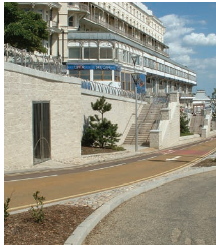
External corner blocks and copings allow neat detailing.