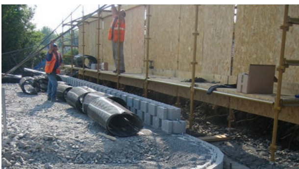
Construction is straightforward and often requires no specialist skills or construction equipment.

efficient, accurate and timely Application Suggestions, assisting in scheme design from feasibility right through to construction.