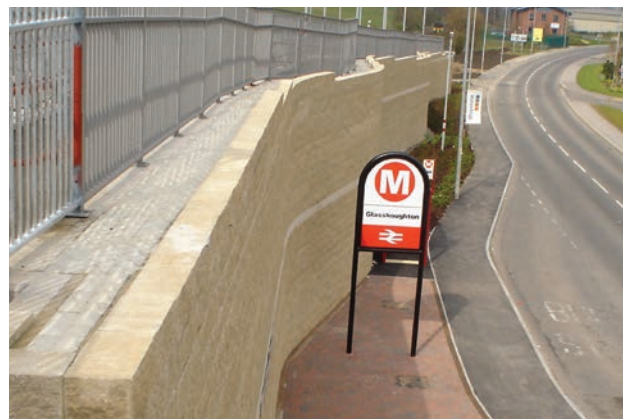
Construction of attractive infrastructure retaining walls with structures with a 120 year design life.