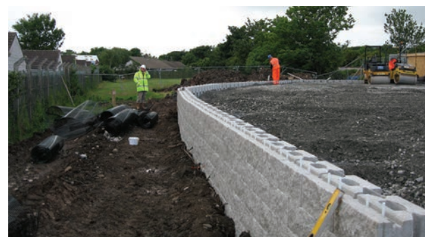
TensarTech™ TW3 facing units are simple to install and can easily accommodate tight concave or convex horizontal curves.