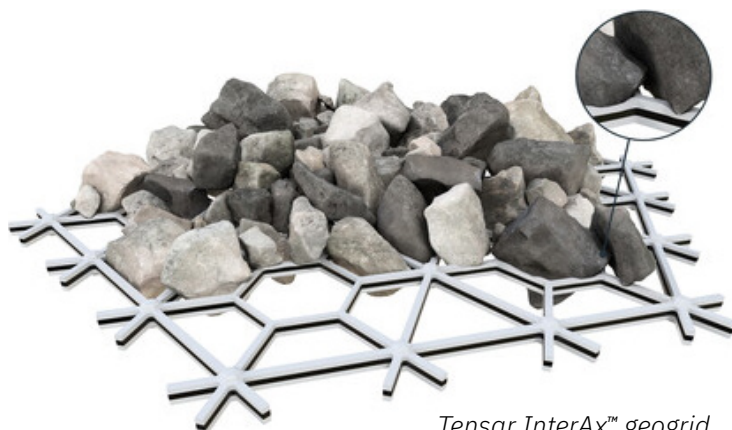
Tensor InterAx™ geogrid

Major investments in ongoing research provide sitework solutions that often result in significant project savings for our clients around the world. And now, those decades of research, development and innovation have resulted in Tensor's latest achievement: the introduction of Tensor InterAx geogrid.